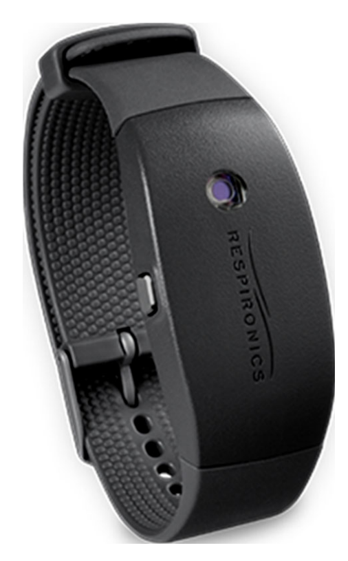
Fig. 1 Philips Actiwatch 2

Two measuring stations were used, one in the center of each side wall, to record the air temperature, relative humidity, and CO<sub>2</sub> concentration at 5-min intervals. No noise measurements were made inside or outside the room. A miniature data logger (HOBO U12-012) recorded the air temperature and relative humidity with an accuracy of \pm 0.35 K and \pm 2.5\% , respectively, and the signal from a CO<sub>2</sub> sensor (Vaisala GM20), calibrated for the range 0-5000 ppm, with an accuracy of \pm (2% of range + 2% of reading). The ventilation rates were calculated from the CO<sub>2</sub> concentration at steadystate and the CO<sub>2</sub> generation from each person, the latter based on an activity level of 0.7 MET (sleeping), a standard respiratory quotient of 0.83, and the DuBois body surface area of the subjects. The maximum CO_2 concentration during the night was used if no steadystate concentration was reached. Steady state was